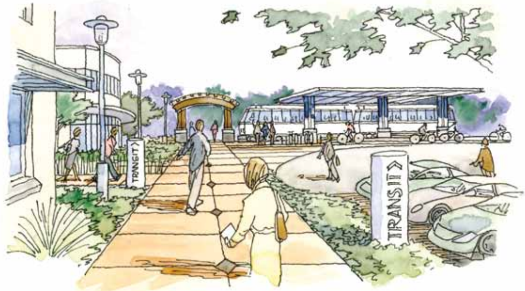
Pedestrian connections to transit